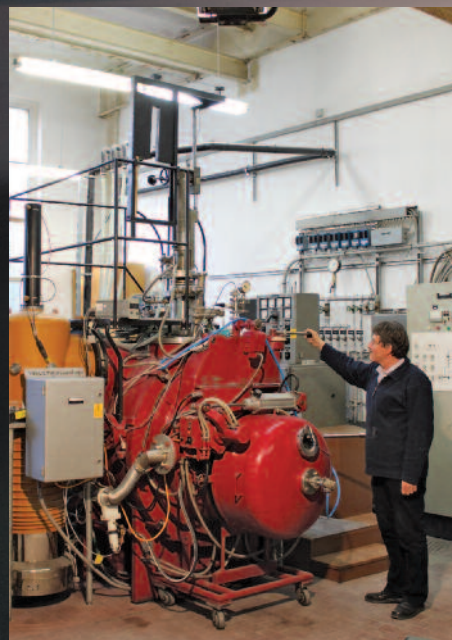
Vacuum oven at the St. Gallen art foundry

Extensive—and expensive—work goes into the making of the watch components from the retired engine parts. Armin Strom sends the parts to a St. Gallen, Switzerland, art foundry where they are cleaned in a vacuum oven and then liquefied via an intense process that removes all oil and air bubbles so that the end result is a pure finish. The