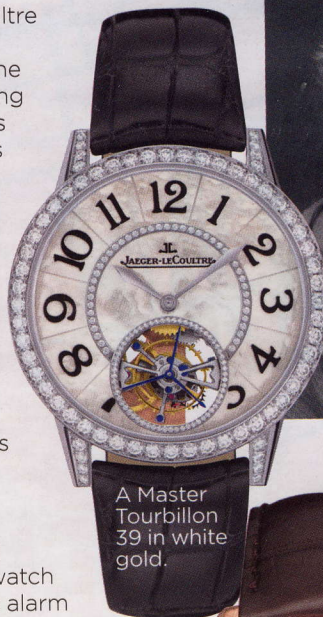
A Master Tourbillon 39 in white gold.