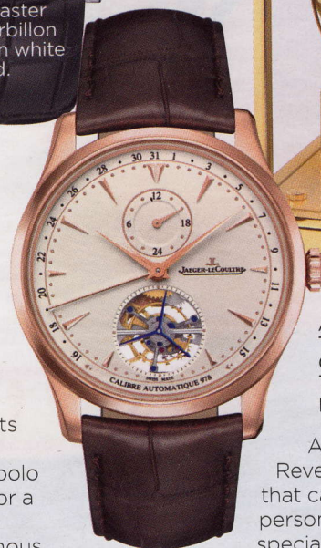
A Master Grande Tradition Complication Tourbillon in pink gold.

The Atmos Classique clock in yellow gold.